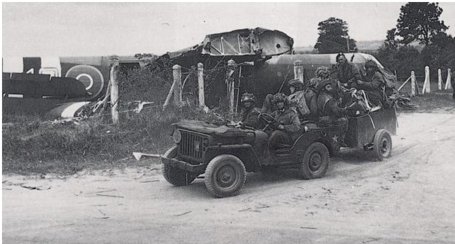
Men of the 1st Battalion The Royal Ulster Riflemen move off from LZ 'N'.

The Ulstermen remained in this area for the following week and endured a great deal of shelling and numerous harassing attacks throughout, although no truly serious attempt was made to dislodge them. On the 13th June, with the 51st (Highland) Division arriving to assume responsibility for the southern flank, the 6 th Airlanding Brigade was moved northwards and the 1st Royal Ulster Rifles were ordered to relieve the beleaguered 12th Parachute Battalion in Bréville.