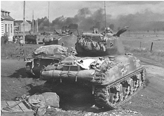
3rd Armored Sherman tanks in battle