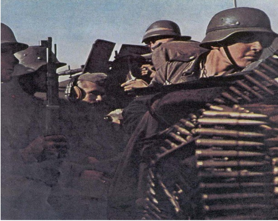
The men of the Kampfgruppe ready themselves for action!!