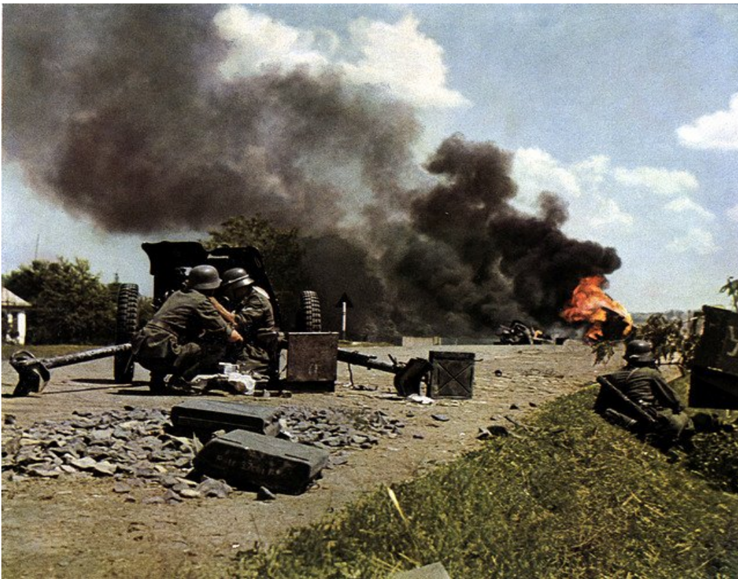
Antitank platoon destroys another Sherman!!