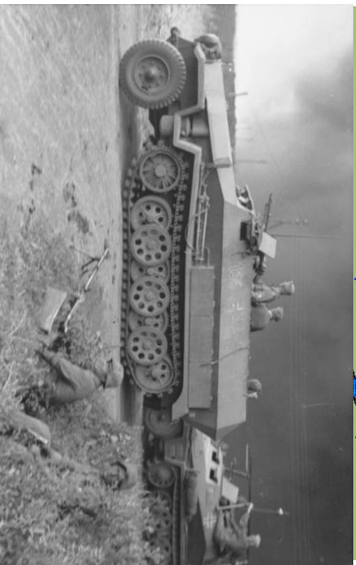
Orel 1 1942