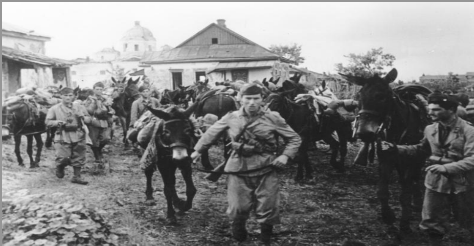
Bundesarchiv, Bild 183-B27180 Foto: Lachmann | Juli 1942